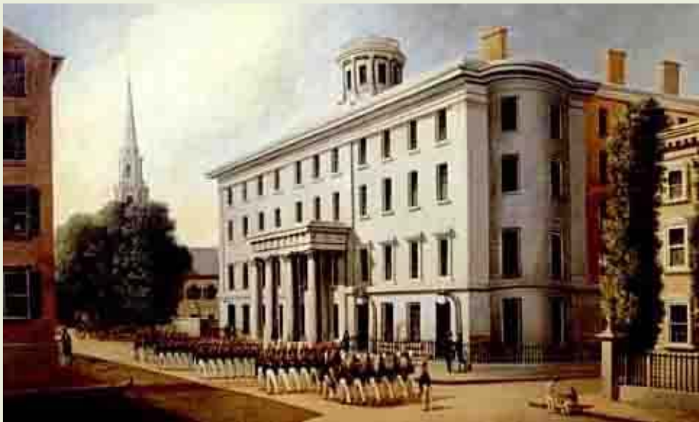
A painting by James Bennett, ca 1830s, showing the Granary's new neighbor, the Tremont House. In the background is the old Granary wall, before the new entrance and fence were added in 1840.

over-looking the desolate-looking Granary Burying Ground. On the other side of the site, at the corner of Tremont and Beacon Street, the Tremont House Hotel was built in 1829, designed by the well-known architect Isaiah Rogers. It was the first hotel in the country to feature indoor plumbing and was considered