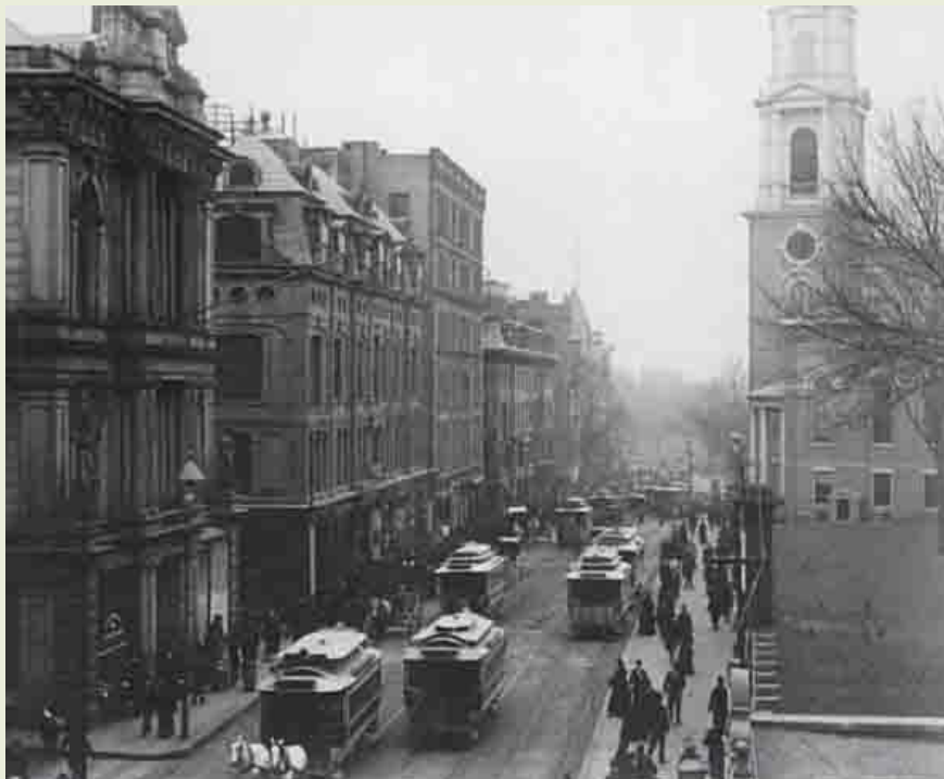
Trolley traffic was heavy in front of the Granary Burying Ground before the subway was installed in 1895.

In 1897 a Cemetery Department was created in the Boston city government which took over the ownership of the burial grounds from the Board of Health. By this time, almost all burial activity was