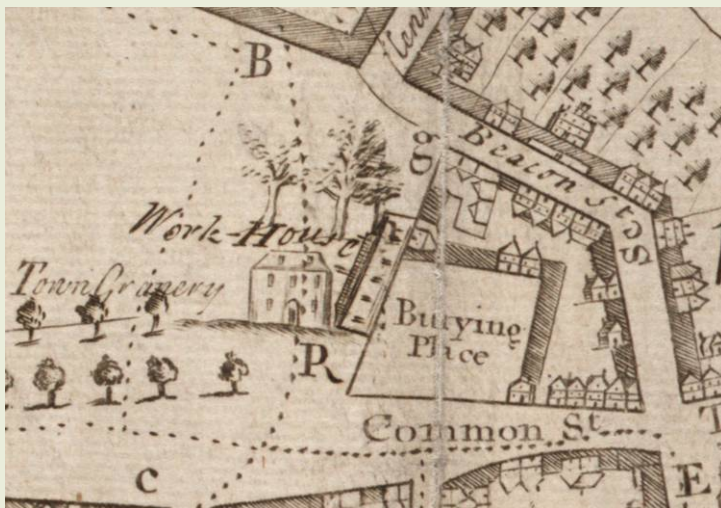
A map from 1743 shows the almshouse, the workhouse, the bridewell and the town granary next to the burying ground.

More public buildings were to be built around the burying ground. In 1721 the town erected a bridewell,