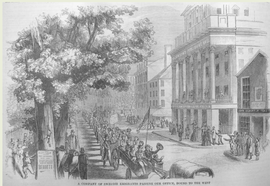
The Paddock elms in front of the Granary Burying Ground, in a drawing from the 1850s from Gleason's Pictorial magazine. You can see the Granary fence in the background.

The faintest beginnings of beautification of the Granary occurred when trees were ordered planted along all burying grounds in 1712. Fifty years later, Captain Adino Paddock and John Ballard continued this