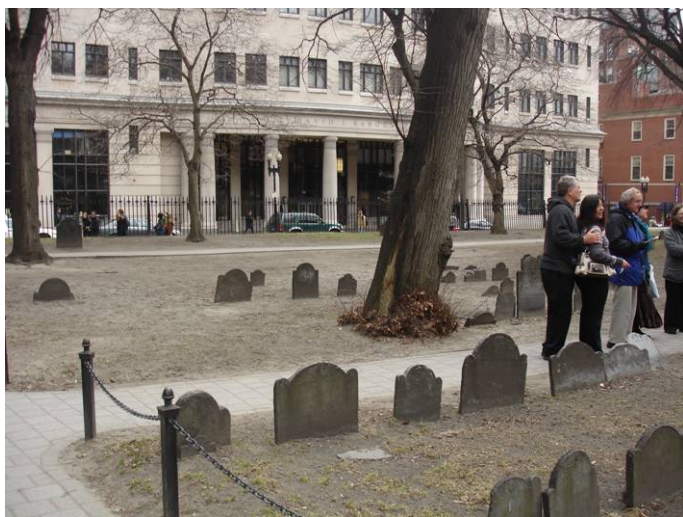
Previous projects have failed to make grass grow in this area.

Although the scope of the project was straightforward, some of the details were more complicated when it came to drawing up construction documents. The most difficult item was the post-and-chain fencing. We need nearly 1,600 linear feet of post and chain. Typically the Boston Parks Department uses steel fencing in this application. We researched the cost of steel fencing and came up with a very large figure: $100,000, which was more than we had initially realized. However it seemed