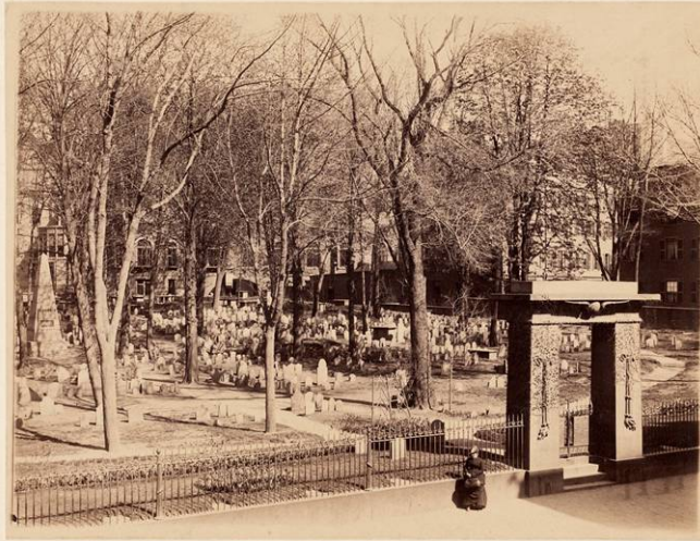
Granary gates, front fence and wall from photo, date unknown.

gate and fence that still form the entrance to the site. Originally the plan was for the city to pay for one-quarter of the cost with the public paying for the rest. However, it proved impossible to raise the three-quarters of the cost, so the city of Boston then agreed to pay for half of the project with the public paying for the other half. The granite used in the project was taken from the same quarry as the stone used to build the Bunker Hill Monument. In 1851 the Boston Daily Atlas reported that “the Granary Burial Ground has recently been much improved by the removal of dead tress and under brush, laying out ornamental paths.” This period also saw the most controversial landscaping development in the Granary: the rearrangement of headstones. It is not clear when these rearrangements (unfortunately there were