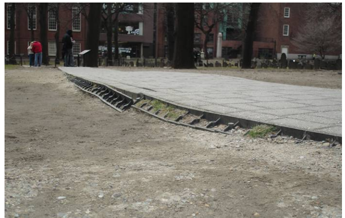
Example of erosion and damaged edging along pathway.

occurred in the larger context of a cemetery: there are approximately 2,345 grave markers and an estimated 6,000 bodies in the two-acre site. This makes any construction very difficult. How can the site accommodate all its visitors without moving headstones, disturbing graves or paving over the burying ground? To make matters more complicated there is no parking at the site, no water or electricity