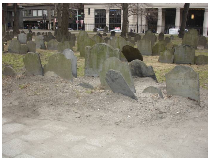
Erosion, compacted soil and poor drainage create muddy areas.

One of the goals of the project is to grow grass in areas where it has previously had troubles growing. We have had these areas professionally seeded several times in the past decade but the grass has never taken. Seventy percent of the trees in this site are Lindens. These trees create dense shade and have surface feeder roots making it very difficult to grow grass on them. Tree pruning is part of this project and it is hoped that this would allow additional sunlight to reach the grass in dark areas, encouraging it to grow. Soil testing by the University of Massachusetts revealed that the soil was