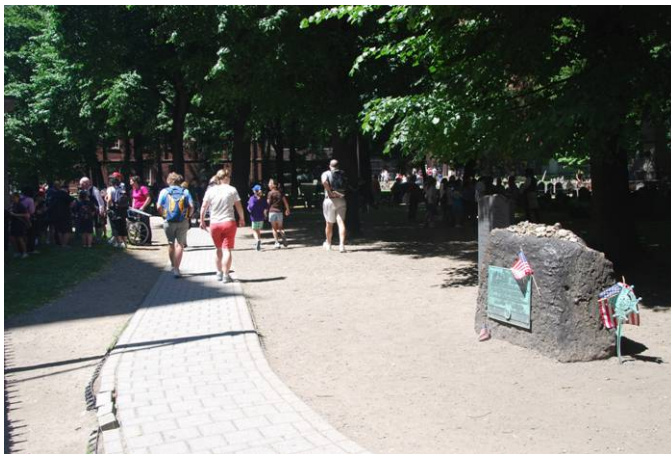
A worn-down spot by Sam Adams' grave.

Wear and tear from so many feet walking through the site had become evident to everyone, including the Freedom Trail Foundation. The organization chose the Granary as a recipient for its first grant from its Preservation Trust Fund. The first part of the $125,000 grant was to hire a landscape architect to study the problem and propose a solution to this dilemma.